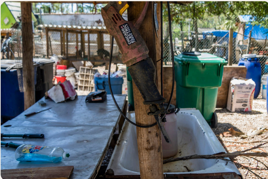
A reciprocating saw hangs ominously next to a slaughter table.