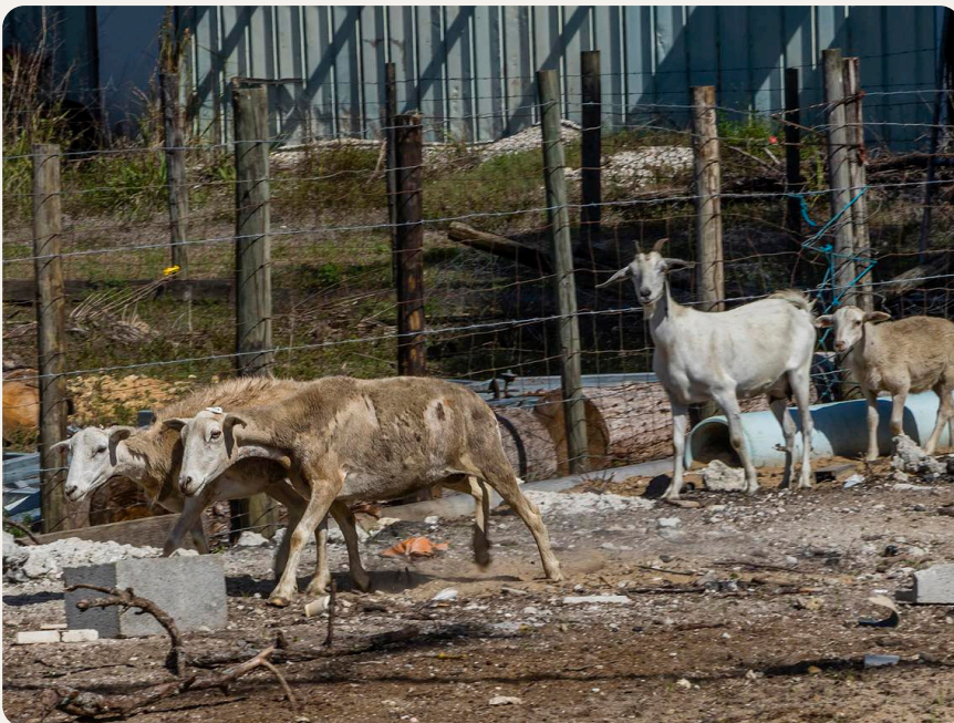
Sheep and goats were living in filth and had no access to forage.

In 2020, CCFS partnered with Farm Sanctuary, Animal Legal Defense Fund, and five local sanctuaries to save 113 animals from an illegal slaughterhouse.