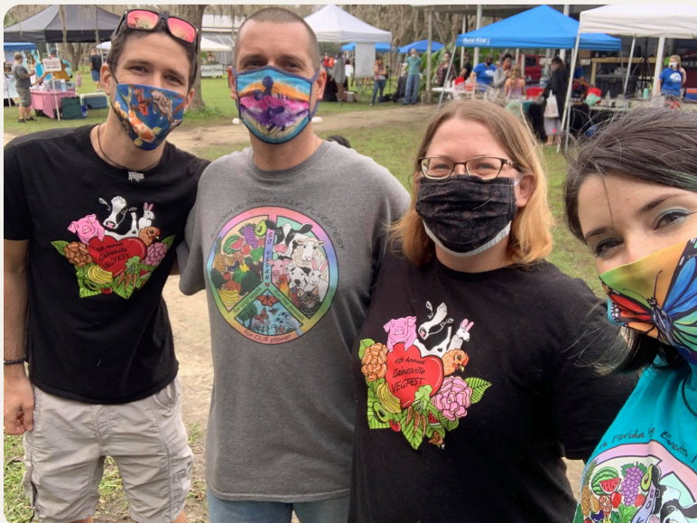
Guests and vendors at our first-ever Farmers Moo-ket.

This year was uniquely challenging, but it highlighted how much we have to be thankful for. At the top of that list is YOU . You all allowed us to continue carrying out our lifesaving work, and helped us spread our message of compassion to ever-larger audiences. Thank you for sticking by us during this difficult time.