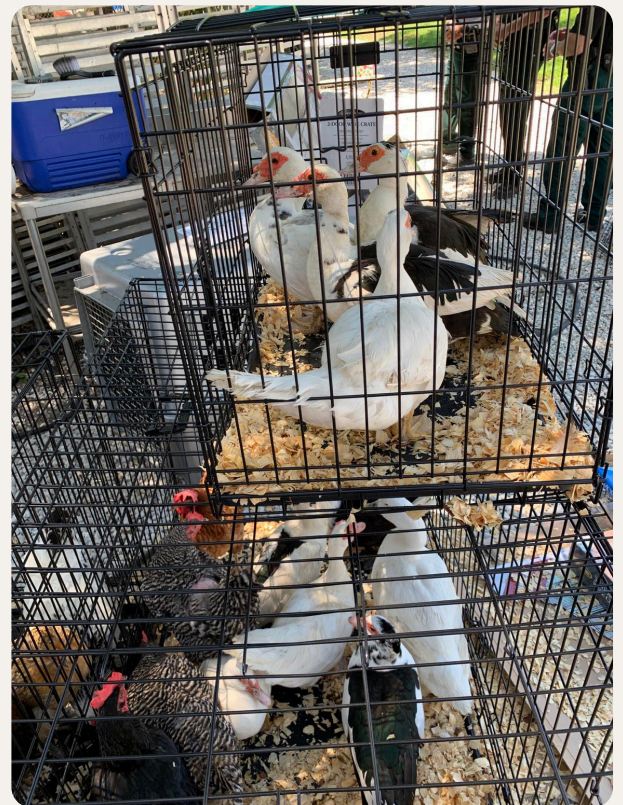
Birds were crammed into small, filthy enclosures.